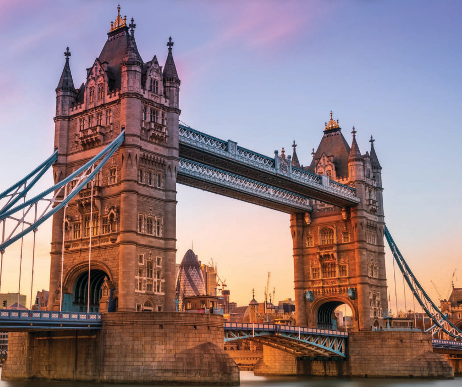
Tower Bridge in London, UK